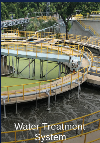
Water Treatment System